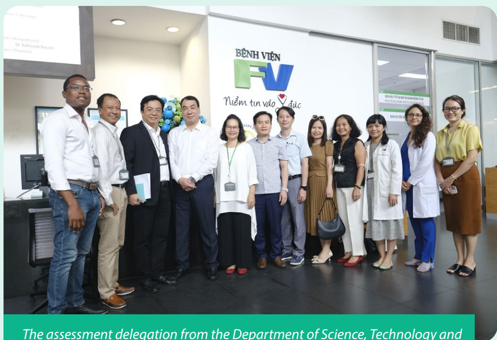
The assessment delegation from the Department of Science, Technology and Training, Ministry of Health, during a work session at the end of 2022

Achieving GCP certification is significant for FV Hospital, especially with regards to advancing scientific research and reducing the pressure of treatment costs on patients. Accordingly, patients who participate in the clinical trial process are guaranteed their benefits, provided with full information about the trial programme. Patients engaging in the programme will have all their treatment costs covered by the sponsoring unit during the research period.